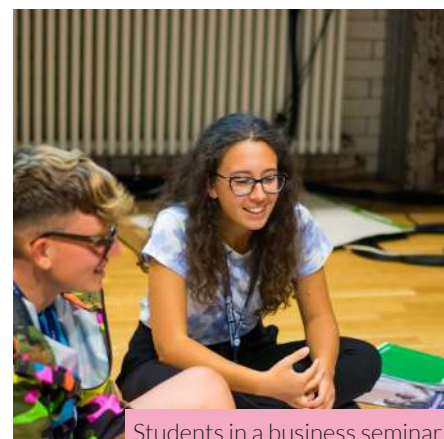
Students in a business seminar